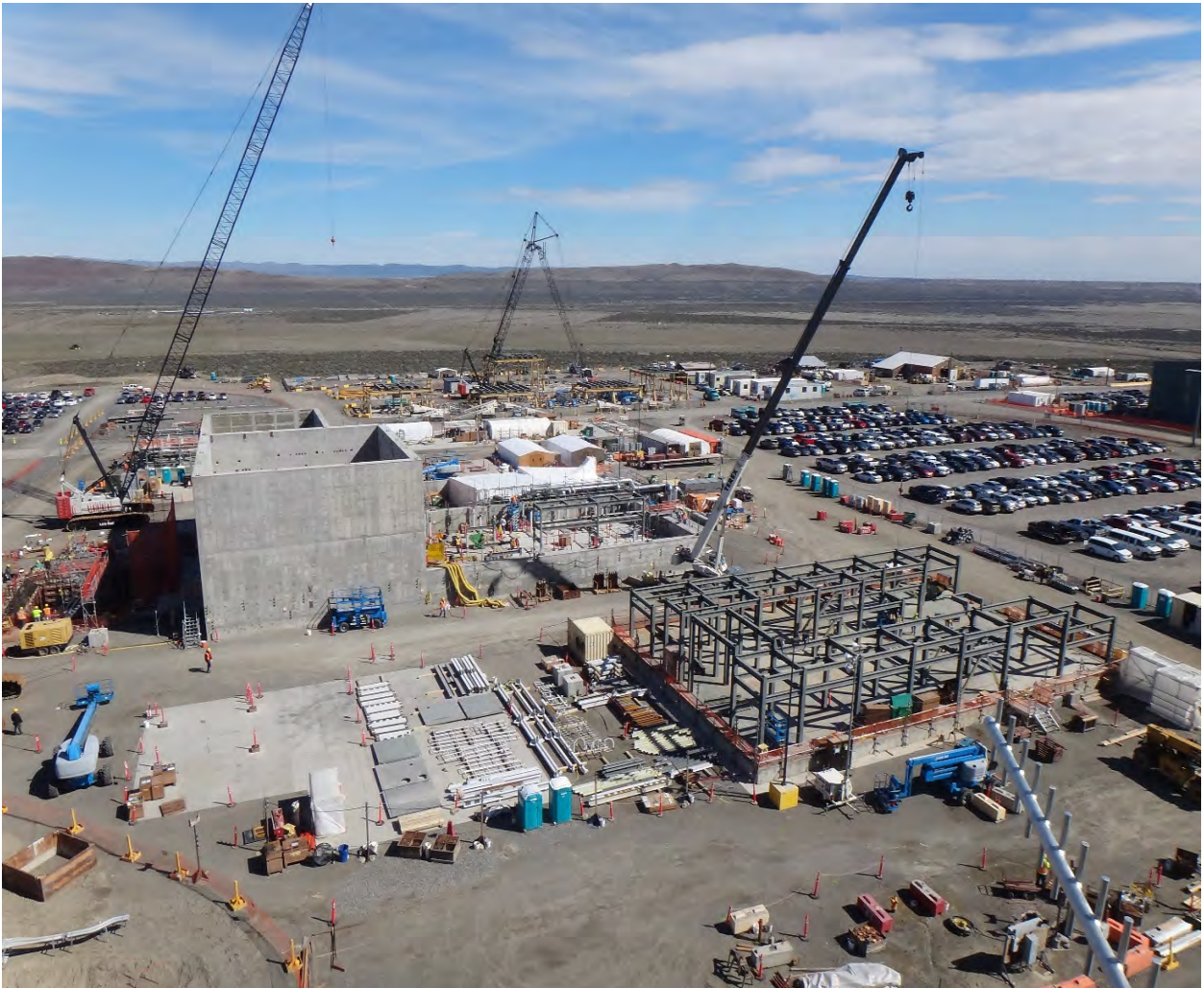
The Effluent Management Facility