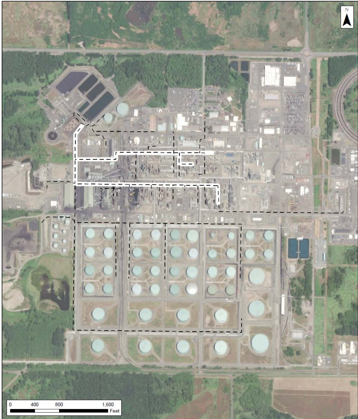
EXHIBIT A Map of Oily Water Sewer Main Trunk Lines