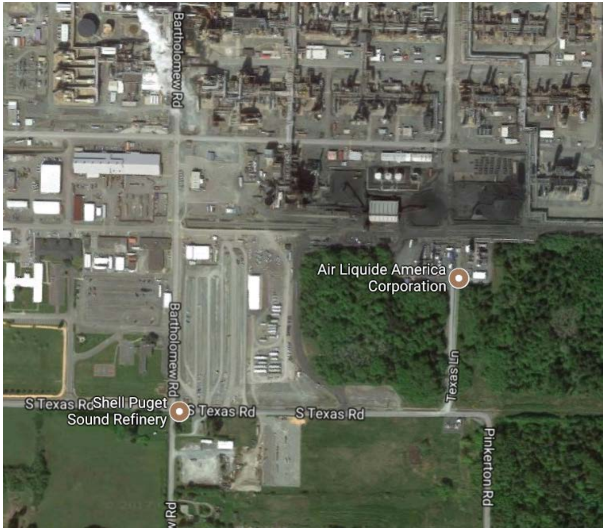
Figure 2B Air Liquide location detail, next to Shell Refinery