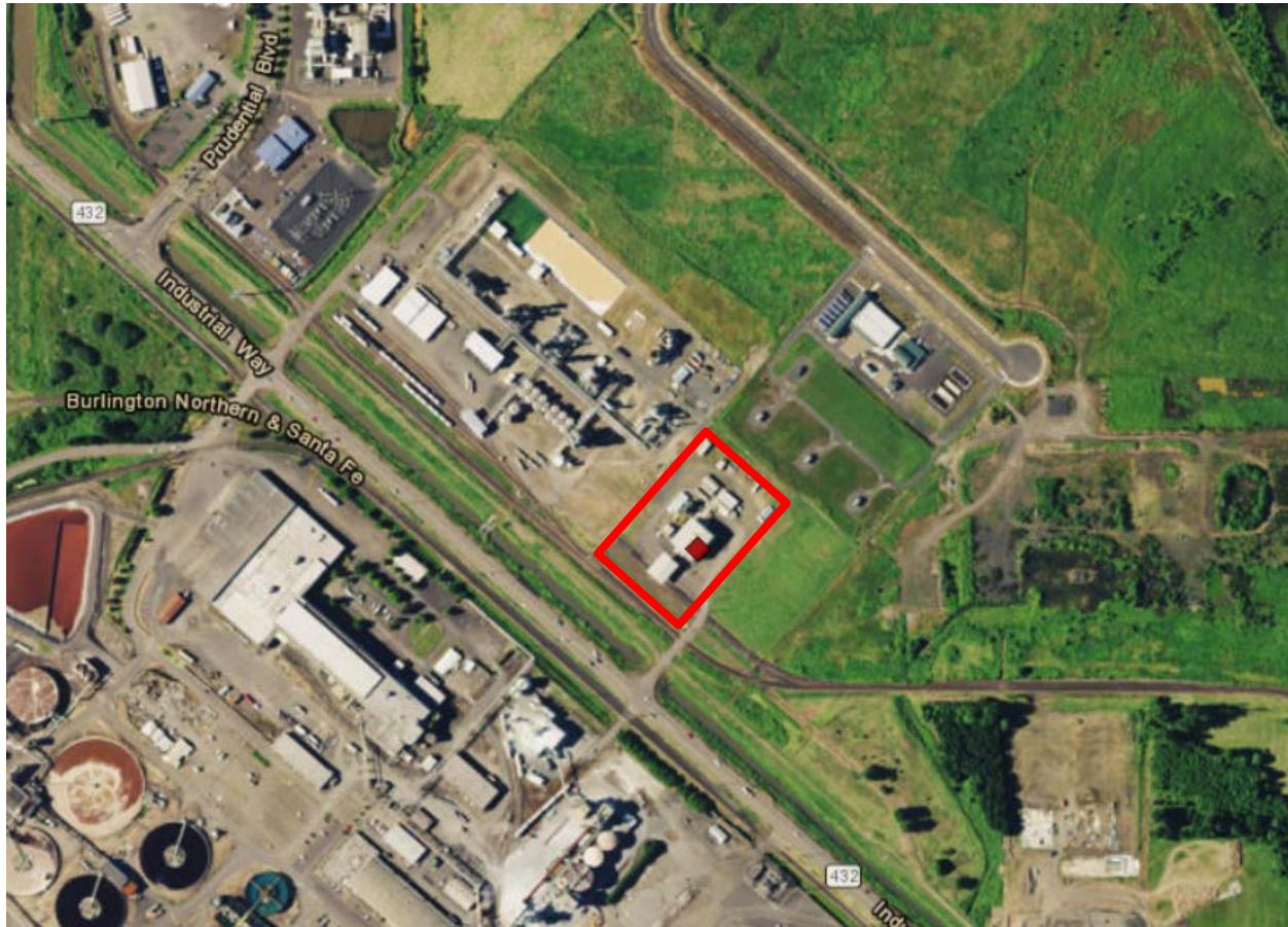
Figure 1 Facility Location Map