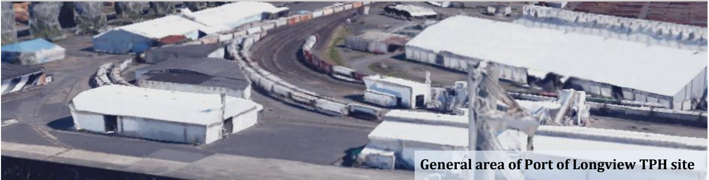
General area of Port of Longview TPH site