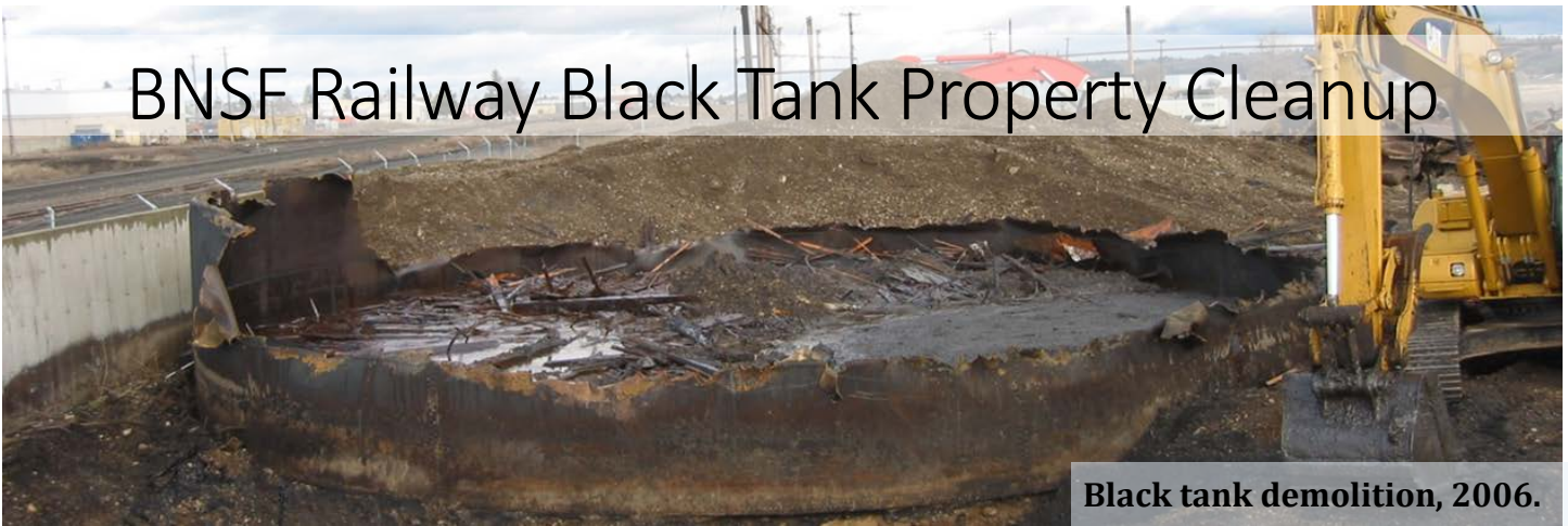
Black tank demolition, 2006.

Comments accepted: June 4 – July 3, 2018