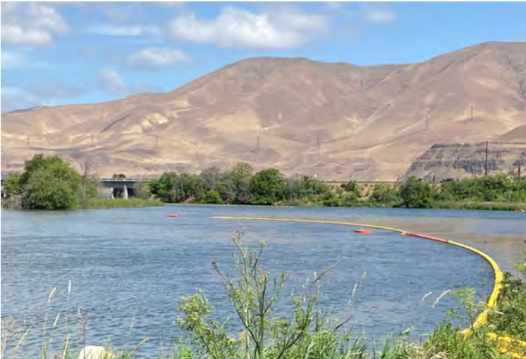
LDR-0.1M Photo: From right riverbank, looking northwest towards Deschutes River confluence. Strategy is closer to the bridges. Photo was taken in June.