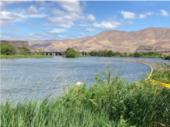
LDR-0.2R Photo: From right riverbank, looking northwest towards Deschutes River confluence. Photo was taken in June.