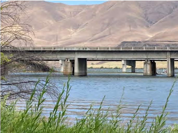
LDR-0.0L Photo: From upriver, looking northwest towards collection point below bridges. Photo was taken in June.