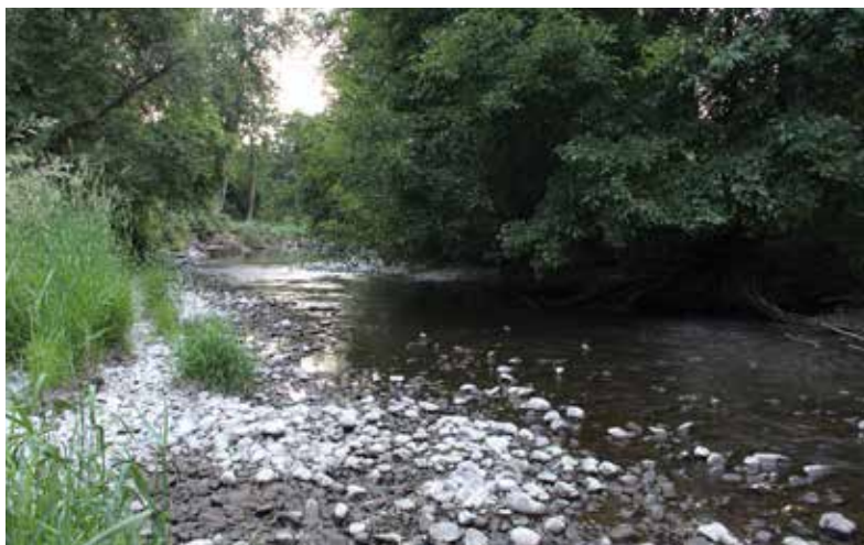
Low water in July on the Walla Walla River at Pepper Bridge.

Despite the intent, the Partnership did not clearly establish improved streamflow as a core goal in its strategic plan. It was not explicit in the mission statement, and only appeared in the strategic plan in an objective associated with one of numerous goals.