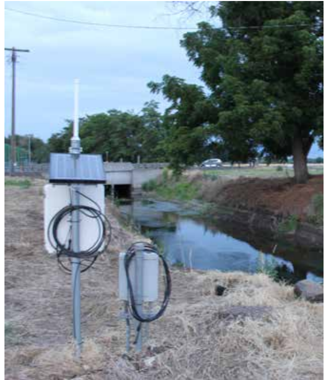
A solar-powered stream gauge measures water levels near Gardena, Washington.

Three collaborative water management organizations use practices that may serve as useful examples in the development and implementation of an accountability framework in the Walla Walla watershed in the future: the Yakima River Basin Water Enhancement Project (Yakima Project), Oregon’s Walla Walla Basin Watershed Council, and California’s system of integrated regional water management. These water management organizations were included in our