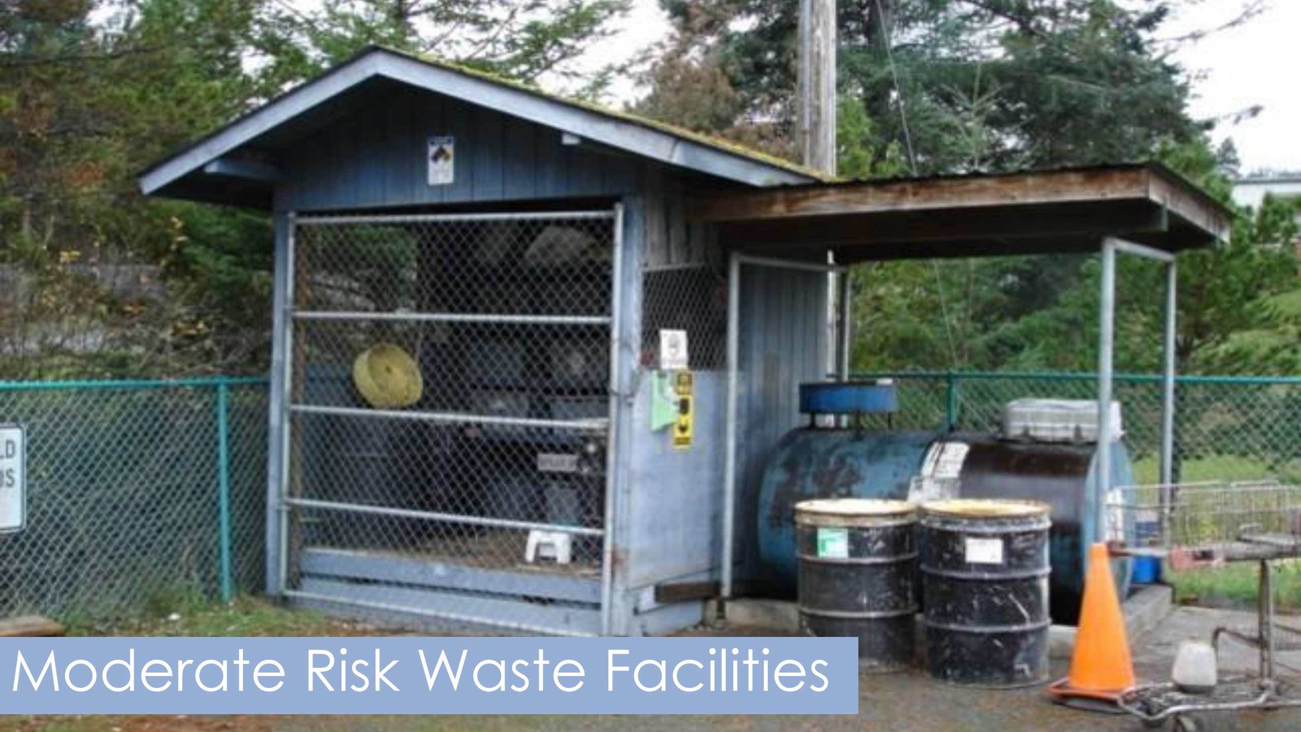
Moderate Risk Waste Facilities